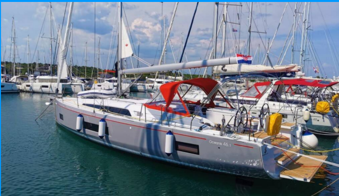
OCEANIS 46.1 - layout 4 CABINS & 2 HEADS

The Sailing yacht Oceanis 46.1 „Nauti Buoy“, built in 2021, is moored in ACI Marina Split, Split - Croatia. The yacht has 4 cabins, can accommodate 8 + 2 persons and has 2 toilets/showers.