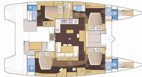
Lagoon 52 version 5 cabins - 5 cabins version