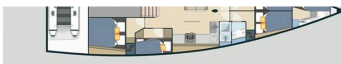
5 double Cabins+crew cabin & Garage