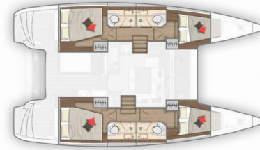
4 cabins 4 Salles de bain / 4 cabins 4 bathrooms