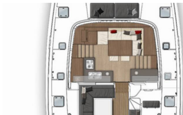
arré et cockpit / Saloon and cockpit